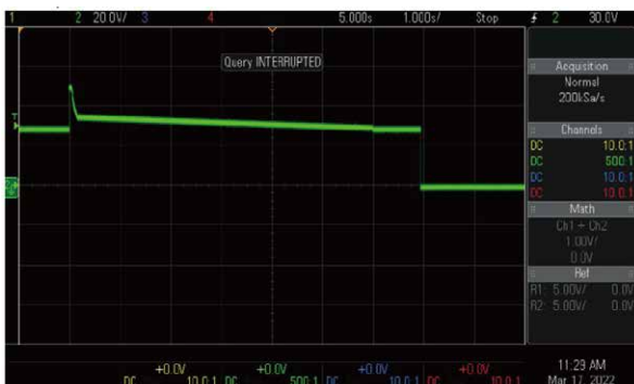
LDC302 28V abnormal voltage transients (overvoltage)