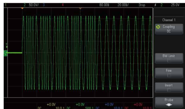
SAC303 115Vac abnormal frequency transients (over frequency)